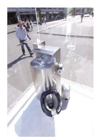
WC - view from inside