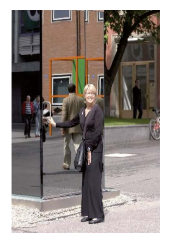
WC - view from outside